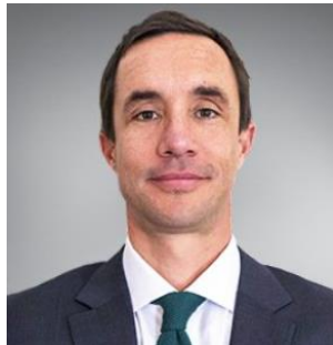
H.E. Minister Juan Carlos Jobet Minister of Energy Chile