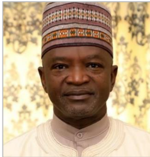
H.E. Minister Dr. Mohammad Mahmood Abubakar Minister of Environment, Federal Republic of Nigeria