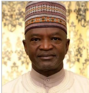
H.E. Minister Dr. Mohammad Mahmood Abubakar Minister of Environment, Federal Republic of Nigeria