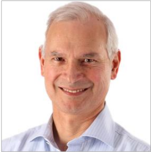
Jamshyd Godrej Chairman and Managing Director Godrej & Boyce Mfg Co. Ltd.