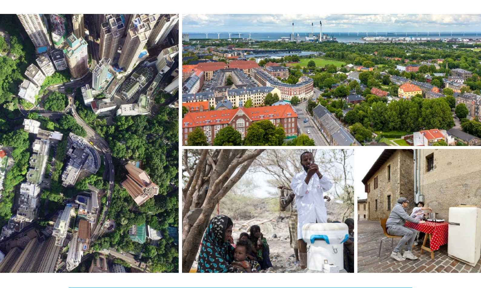
Sustainable Cooling in support of a Resilient and Climate-Proof Recovery