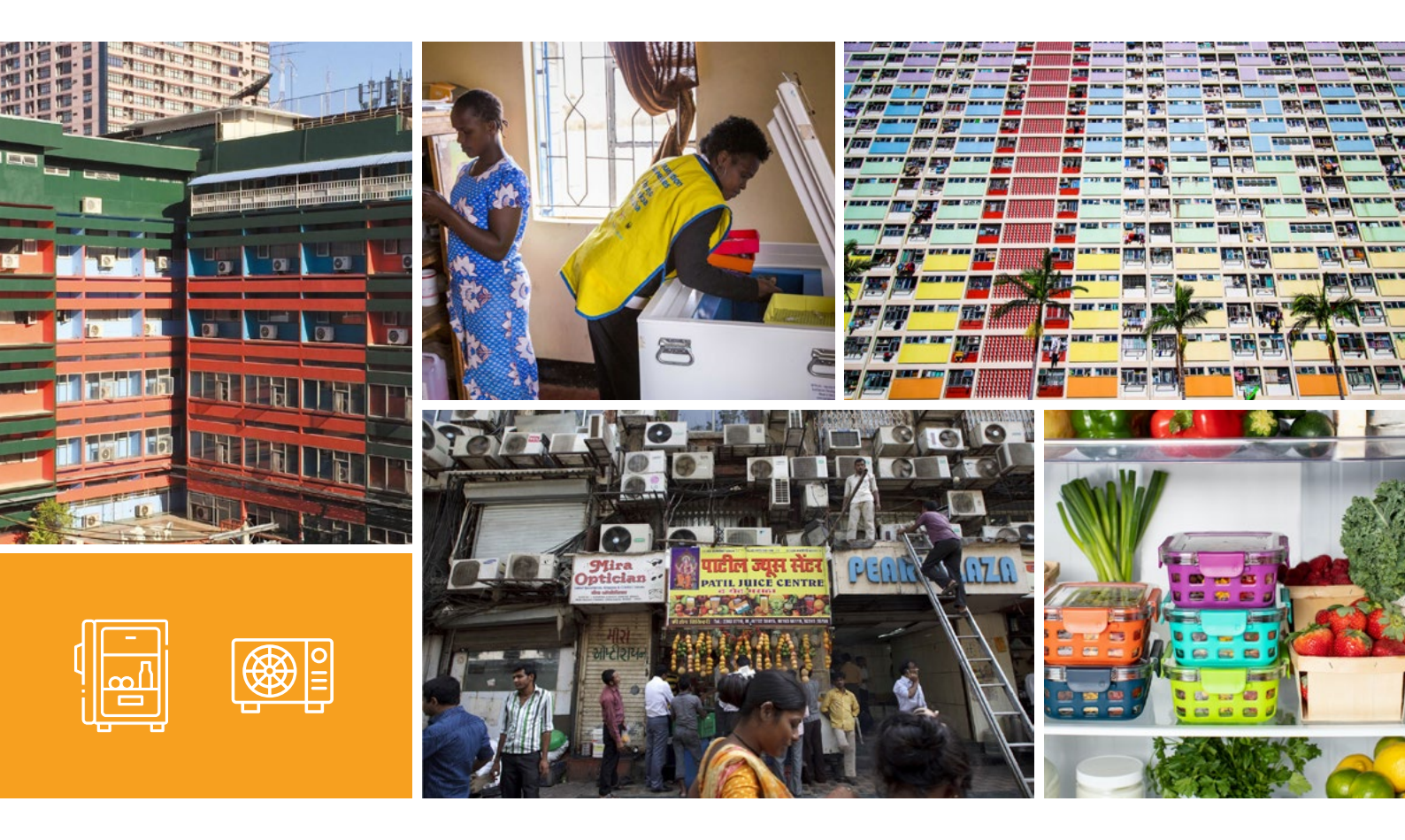
Sustainable Cooling in support of a Resilient and Climate-Proof Recovery

Although companies may argue that in the current economic context limited budget is available for such capital upgrades while their ability to borrow has been equally affected, governments can underwrite and offer credit lines to banks and retailers to catalyse the growth of Pay-As-You-Save (PAYS) financing, on-bill repayment, and Cooling as a Service (CaaS) models in the commercial and even residential market. Multilateral Development Banks also have a role to play as a potential source of funding for cooling capital equipment upgrades. This will allow companies and households to upgrade with no or limited upfront cost ( E3G and K-CEP, 2020 ).